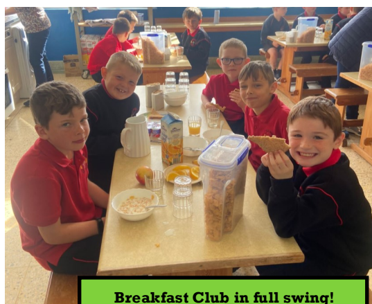
Breakfast Club in full swing!